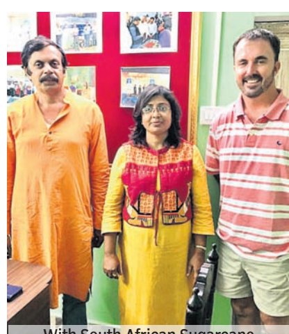
With South African Sugarcane growers at her Stevia nursery

round of training from Central Institute of Freshwater Aquaculture in Bhubaneswar. Speaking about her incredible journey, she