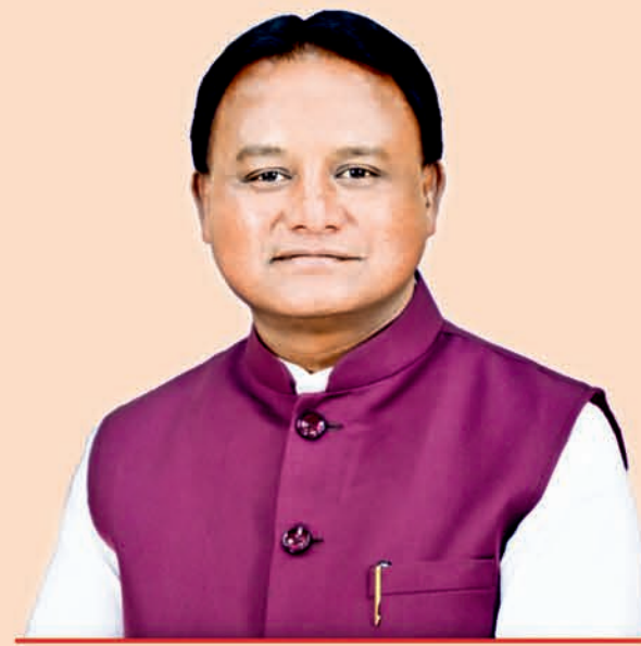
ଶ୍ରୀଯୁକ୍ତ ମୋହନ ଚରଣ ମାଝୀ ମୁଖ୍ୟମନ୍ତ୍ରୀ, ଓଡ଼ିଶା