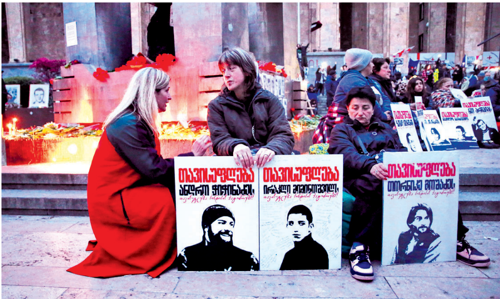
Demonstrators sit with portraits of victims and political prisoners while commemorating an anniversary of the so-called 'Tbilisi tragedy', where twenty people were killed on this day in April 1989 during an anti-Soviet demonstration and marking a Day of Unity at the Georgian Parliament's building in the center of Tbilisi, Georgia, early Wednesday

He said the coalition pact provided a "strong and clear signal" both to its own citizens and other European countries, adding, "Germany is getting a government that is capable of action and strong."