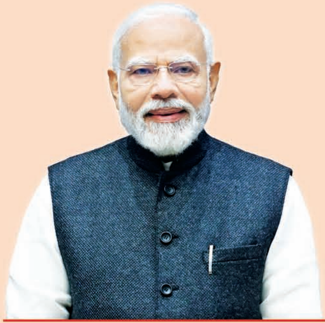
ଶ୍ରୀଯୁକ୍ତ ନରେନ୍ଦ୍ର ମୋଦୀ ପ୍ରଧାନମନ୍ତ୍ରୀ