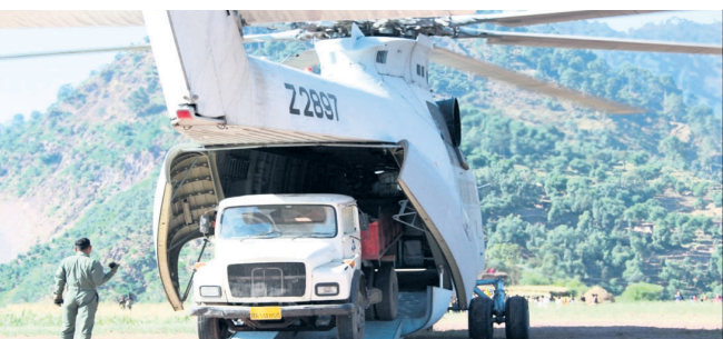
MI 26 Helicopter transporting a Dumper from Jammu to Surukote in October 2010, a remote location between Reasi and Sangaldan

1. EMPLOYMENT GENERATION: Over 14,000 people were employed during construction, with 65% being locals. Additionally, 804 land-loser fam-