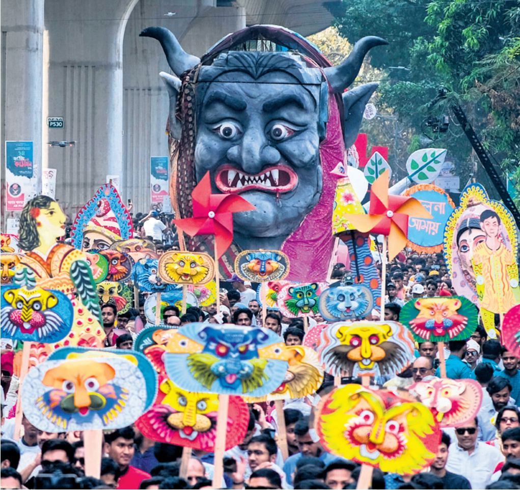
People participate in the Ananda Shobhajatra procession to celebrate the first day of the Bangla New Year in Dhaka, Bangladesh, Monday

It said Chinese authorities had long "refused to afford US diplomats, journalists, and other international observers access to the Tibet autonomous region and other Tibetan areas of China", while "China's diplomats and journalists enjoy broad access in the United States".