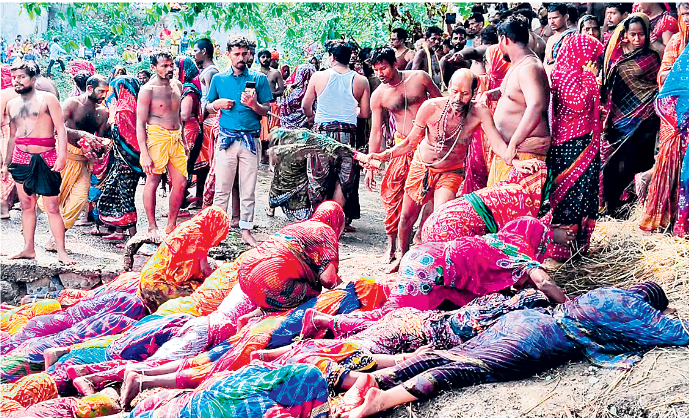
MATTER OF FAITH: Women lay prostrate near a pond as part of penance during Maa Dandakali Jatra at Purusottampur in Ganjam district which concluded Monday

"Many from the Nolia community have already migrated back to Andhra Pradesh," he added. With all fishing boats and dinghies docked, a sense of stillness has descended upon the coastal region. While the state government has announced relief measures, including the distribution of rice and essentials to affected families, many fishermen say they have yet to receive support. A major hurdle is the lack of registration — only traditional fishermen officially recognised by the Fisheries department are eligible for benefits. "This is the toughest time of the year for us," said a fisherman from Baliapal in Balasure district. "We have no income, and our families are suffering. We urge the government to step in with immediate aid." Beyond just the fishermen, the impact ripples across the fishing economy — from transporters and fish sellers to seasonal labourers working in ice plants and processing units. Adding to the pressure, the ban is expected to result in a shortage of marine fish in local markets, driving up prices and affecting consumers statewide. Fishermen's unions and local leaders have called for urgent intervention by the state to provide financial relief and ensure food security during the ban. Without meaningful support, many warn, the coastal fishing community could face worsening hardship.