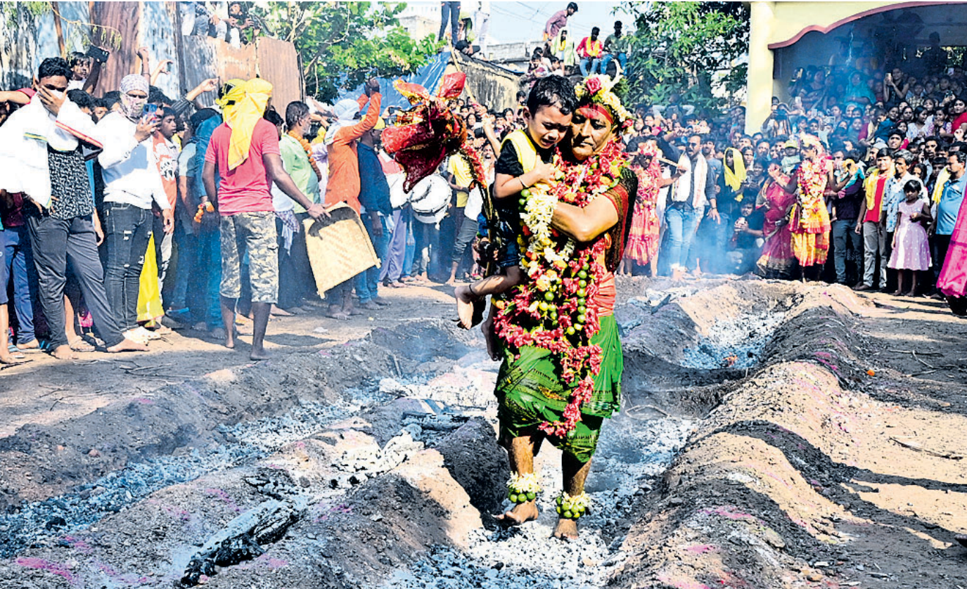
AUSTERITY AND PENANCE: A man carrying a child in arms walks on hot embers on the occasion of Jhamu Jatra at Jugal Kishore temple premises inside Bastari mutt at Badhei Sahi in Buxi Bazar area of Cuttack, Monday

As many as 3,93,618 students had appeared for the exam -2,47,391 in Arts stream, 1,14,980 Science and 25,526 in Commerce stream. 5,721 students appeared in the exams in for various vocational streams.