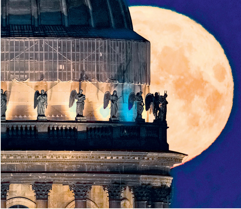
The full moon sets behind the St. Isaac’s Cathedral in St. Petersburg, Russia, early Tuesday