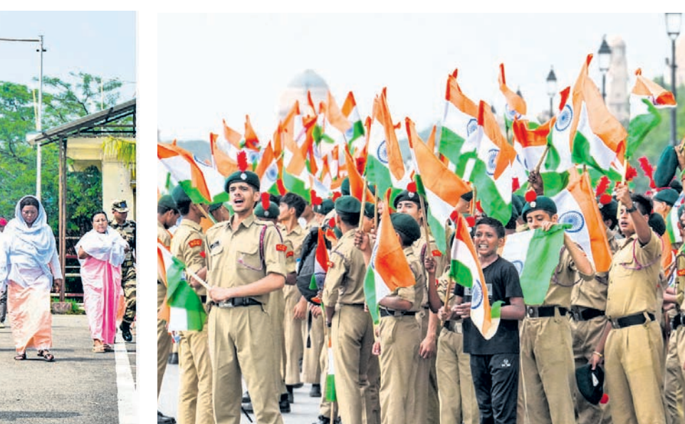
NCC cadets take part in the Tiranga Shaurya Samman Yatra from Kartavya Path to the National War Memorial in New Delhi