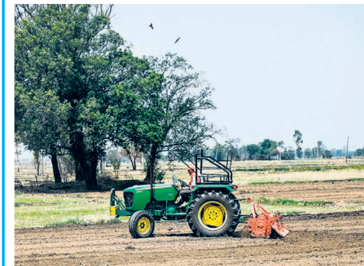
A farm worker at a field, in Jammu. Normal activities were resumed in the area following a bilateral understanding between India and Pakistan