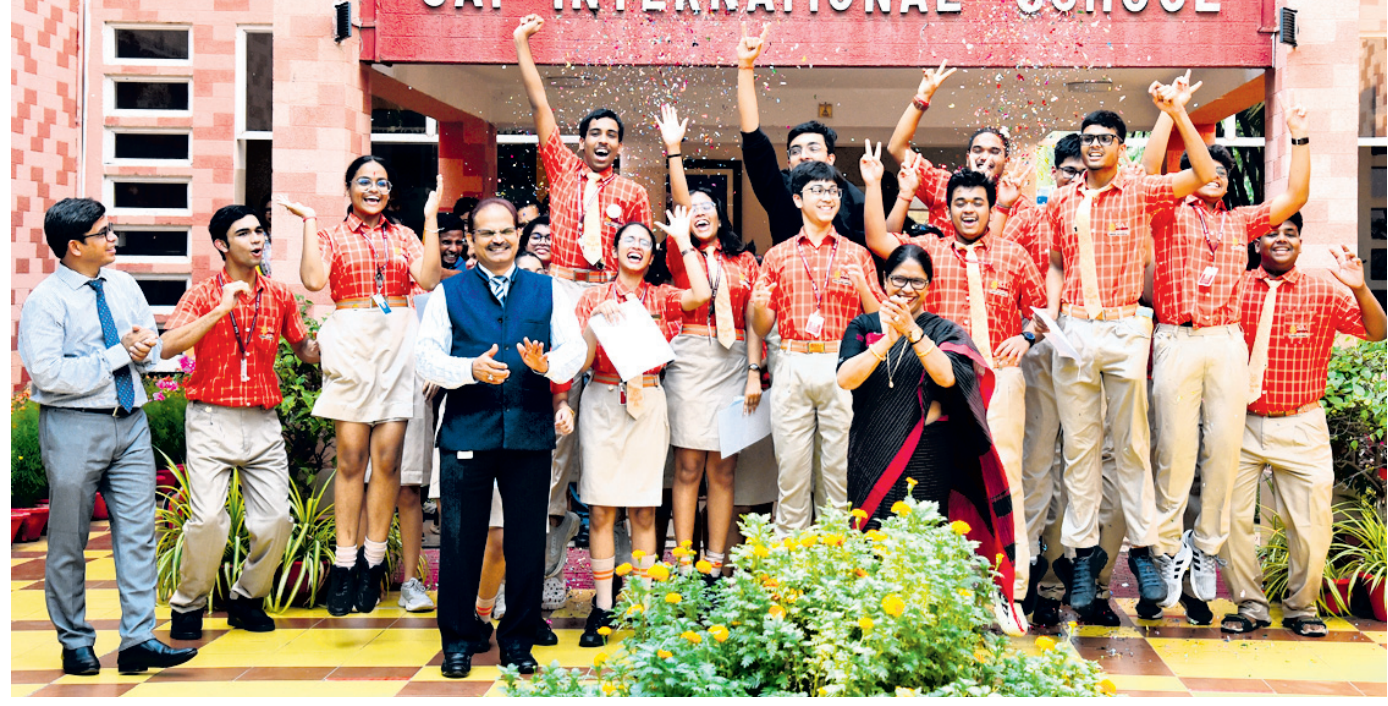
Students and faculty of SAI International School in Bhubaneswar in a euphoric mood following publication of CBSE results Tuesday

Bhubaneswar, May 13: Girls continued to outperform boys in the Central Board of Secondary Education (CBSE) Class X and XII examinations this year, even as the state registered a pass percentage of 78.74 in Class XII and an impressive 92.40 per cent in Class X, according to the Board sources. CBSE sources said Bhubaneswar region secured a pass percentage of 83.64 in Class XII, placing it 11th among CBSE regions across the country. In Class X, the region fared even better with a 92.64 per cent success rate, while ranking 12th nationally. Like national level, girls in state also outperformed boys