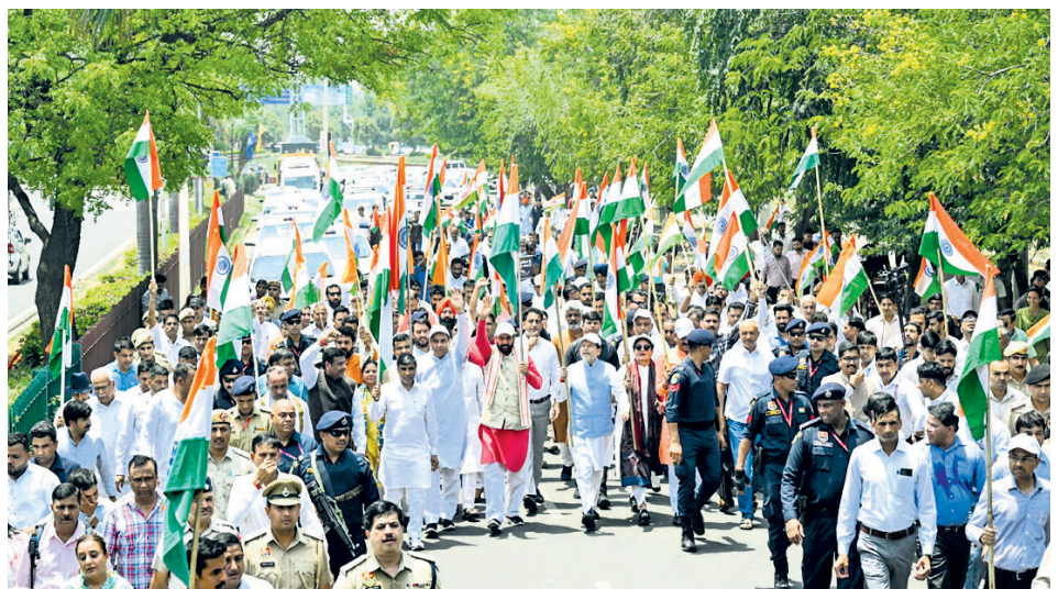
Haryana Chief Minister Nayab Singh Saini takes part in the ‘Tiranga Yatra’, in Panchkula, Haryana