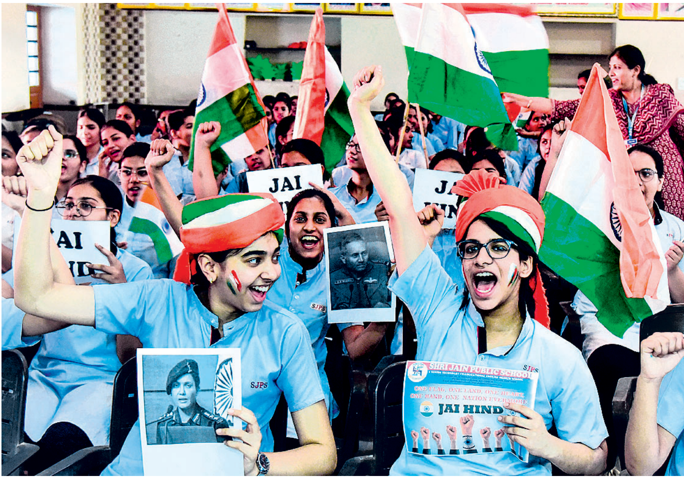
Students hail armed forces personnel for Operation Sindoor, in Bikaner, Rajasthan, Tuesday

To encourage investment in M-Sand, the government will offer industrial promotion subsidies, interest concessions, waivers on electricity charges and stamp duty, and subsidies on electric tariffs, the statement said.