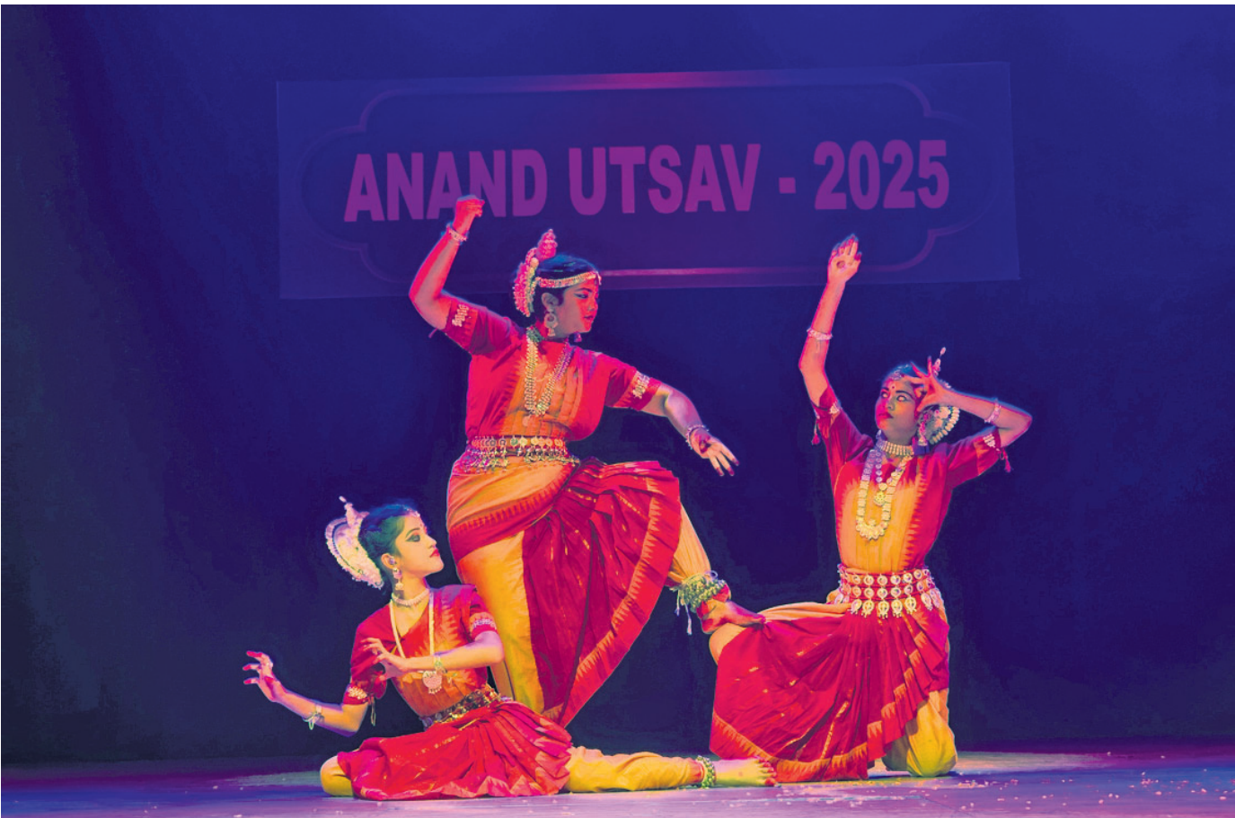
CAPTIVATING SHOW: Artistes perform Odissi during 17th Anand Utsav organised at Rabindra Mandap in Bhubaneswar, Tuesday